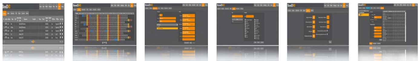
Employees management Calendar management Department management Reports customization Parameters setting Network & devices management

Central manager with respective management in Calendar, Employees users, devices status detecting, departments, parameters, Job codes define, customized reports and network connection, featured with powerful shifts management in 3 basic types (Undefined, Sliding, Fixed) , Flexible pause and extra time.