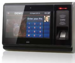
uTouch All-in-One System