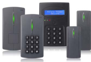
Access Door Reader